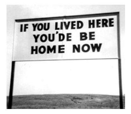
Home Sweet Home!!